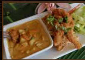
CRISPY CHICKEN YELLOW CURRY