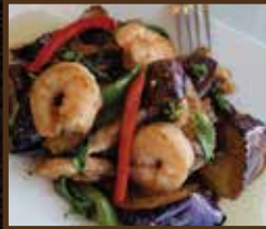
SPICY EGGPLANT WITH BASIL LEAVES