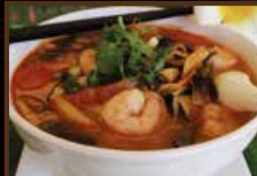
TOM YUM SOUP WITH NOODLES