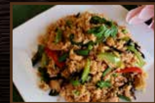
THAI HERBS SPICY FRIED RICE