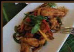
SPICY FISH FILLET WITH BASIL LEAVES