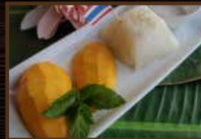
MANGO WITH STICKY RICE