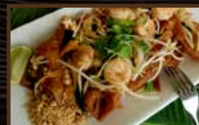
CRISPY WONTON PAD THAI