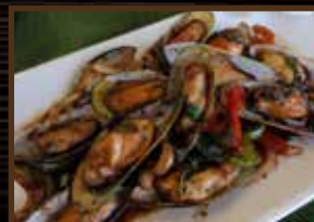
SPICY MUSSELS WITH BASIL SAUCE