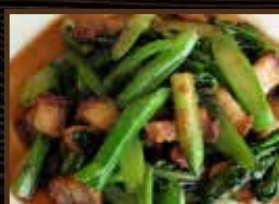
CHINESE BROCCOLI WITH CRISPY