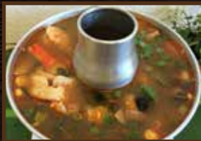
SEVEN SEA SOUP