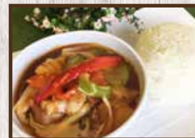
SWEET & SOUR